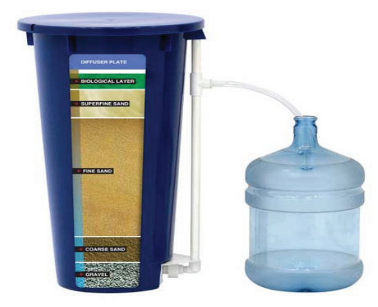
Fig. 4. HydrAid® BSWF schematic [7].

To simulate the water filtration system, PURA developed a filter component test plan and set up a prototype of the HydrAid® filter in a UVA's Civil Engineering laboratory. The HydrAid® filter consists of a gravel layer, two layers of sand in varying degrees of coarseness, and a biological layer, as shown in Figure 4. The filter's biological layer traps most of the microorganisms contained in the water. These microorganisms create a natural food chain that feeds on the contaminants in the water.