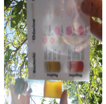
Fig. 3. PURA water test verifying bacterial contamination

To verify it's research regarding the presence and type of contaminants in Tzununa's water, PURA tested a sample of the community's drinking water from the point of source. PURA's tests verified its research findings that the water was contaminated. Moreover, PURA visited Lake Atitlan's office for the Guatemalan Ministry of Public Sanitation, where it obtained valuable water test results confirming that the bacteria was mainly E. Coli and choliform. PURA's findings aid it in simulating Tzununa's water conditions.